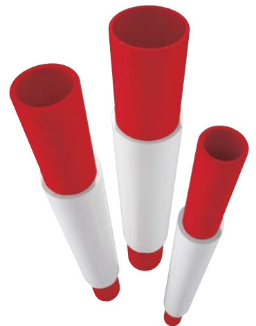
Three convenient sizes!