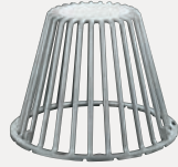
Cast aluminum strainer dome