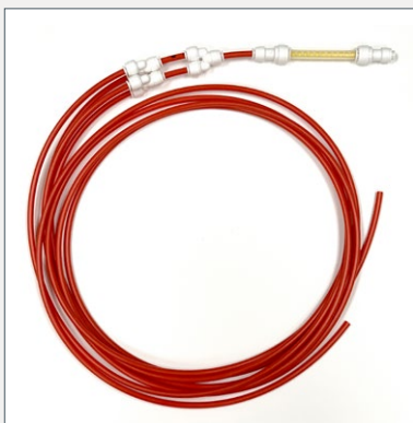
Extra Hoses Available