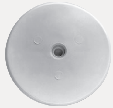
3-in. (75 mm) Locking Plastic Plate